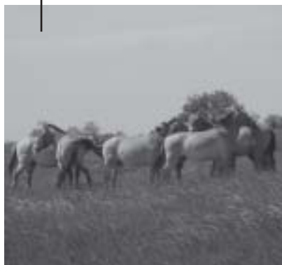
Przewalski horses on the Hungarian steppe; a feast for the eye