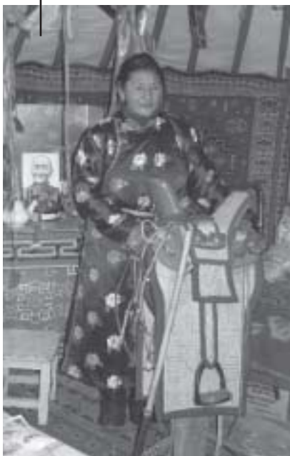
The craft of felt making has now been revived. This woman proudly shows what she made for sale.

being subsidized by the Dutch Ministry of International Co-operation. The herdsmen as well as the local authorities are very enthusiastic and the overall progressive developments made the Netherlands decide to prolong their financial assistance with three years more. The final responsibility rests with the Hustai National Park Trust.