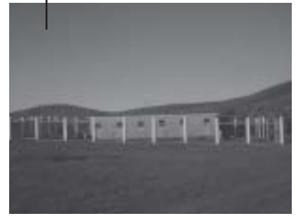
The newly built breeding station.

ject surely has resulted in much goodwill among the herdsman community near Hustai National Park. ■